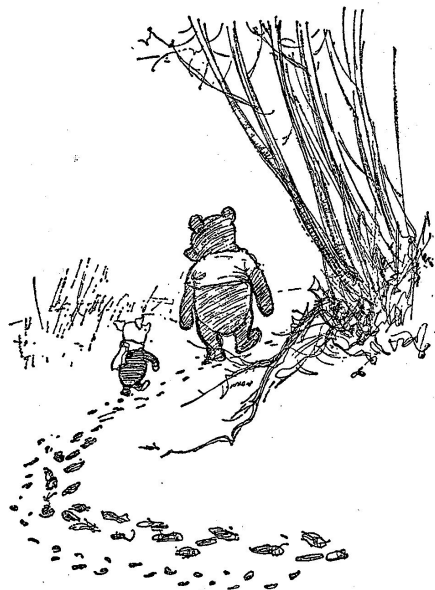
Pooh and Piglet go Hunting

iv Envoy surprised by climate of scepticism; at http://www.smh.com.au/environment/envoy-surprised-by-climate-of-scepticism-20091112-icg5.html